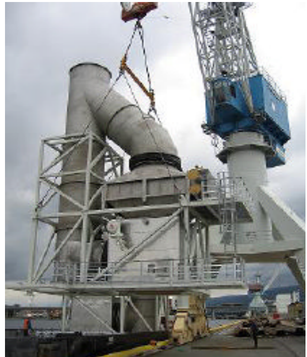
The picture on the left, above shows one of the diverter blades complete with double seal and